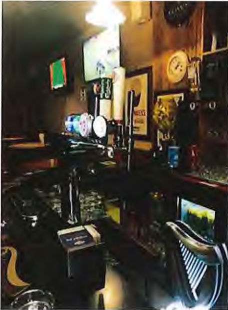
The beer taps were all on and functioning