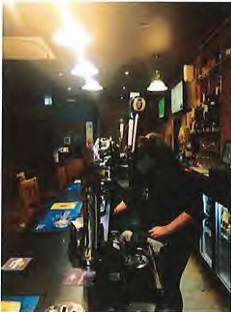
The member of staff was cleaning the glasses that had been left behind by the males