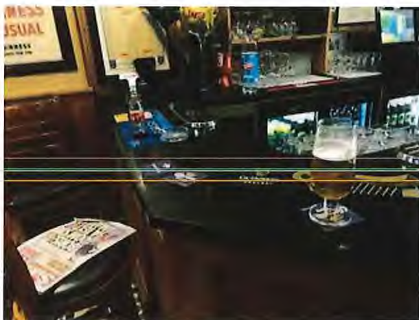
The remainder of the drinks left behind by the males