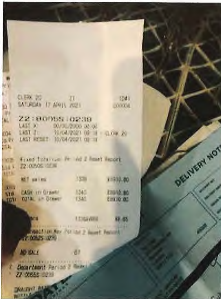
A log from the till showing £8910.80 as 'cash in drawer' dated 17 th April 2021