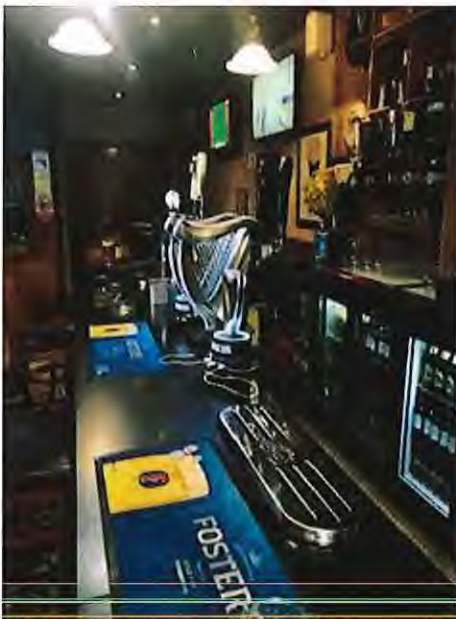
The beer taps were all and functioning