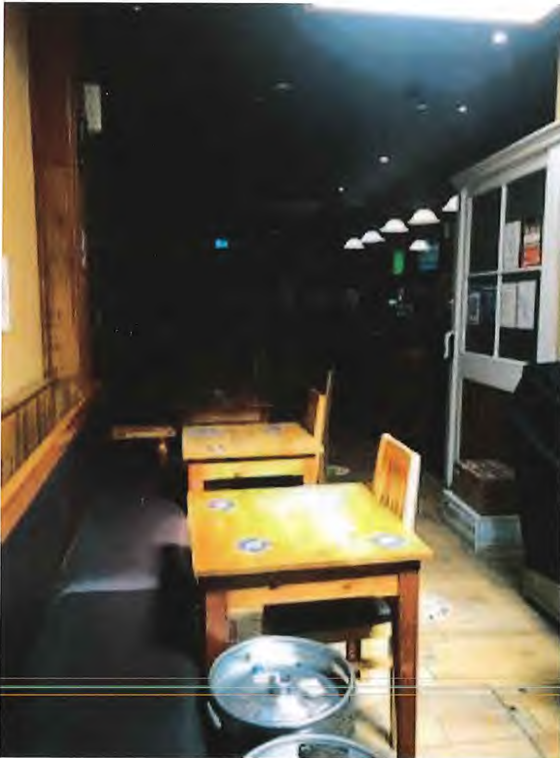
On entering the premises, 9 males and 2 members of staff were found to be drinking alcohol in the premises