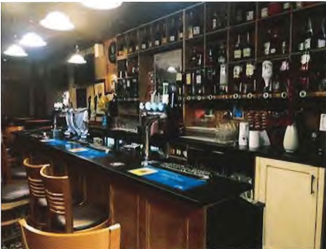
A photograph of The Field before I left the premises.