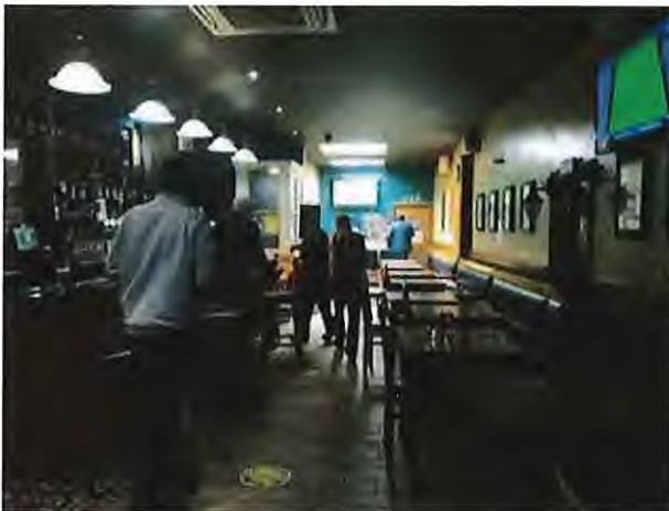
On being asked to leave, the males all left the premises