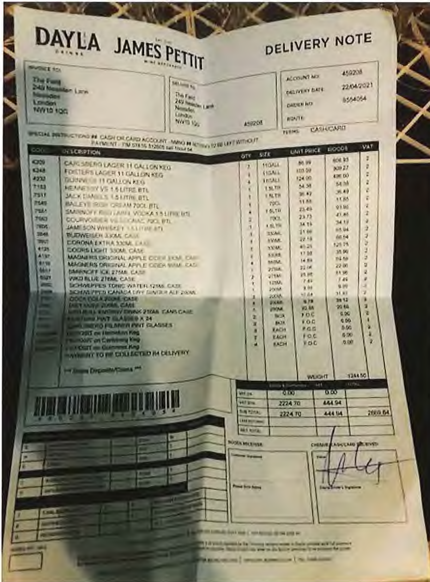
A delivery note addressed to The Field dated 22 nd April 2021 with a list of alcohol that appears to have been delivered to the address