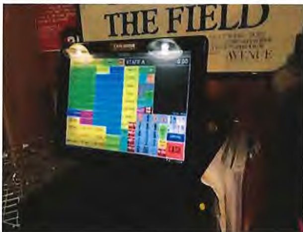
The till was on and in operation