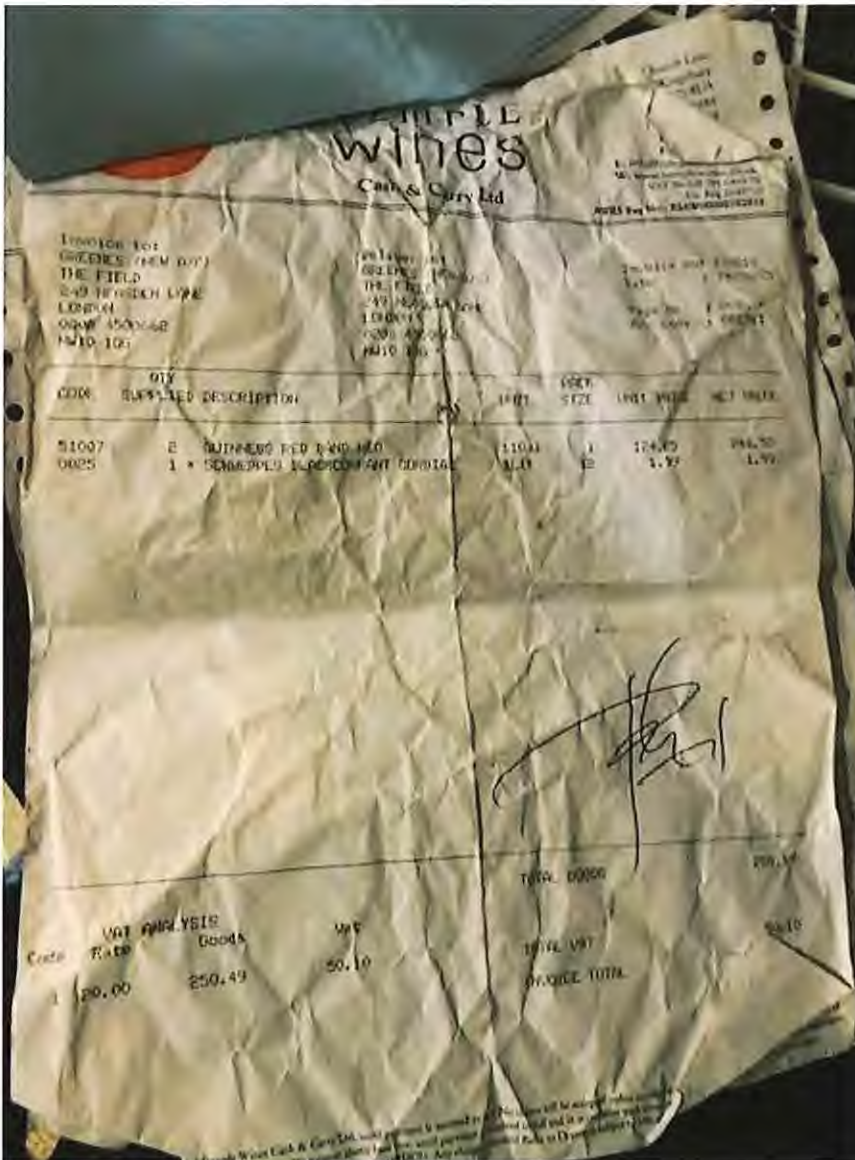
A Cash & Carry receipt dated 14 th April 2021