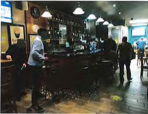
On being asked to leave, the males all left the premises