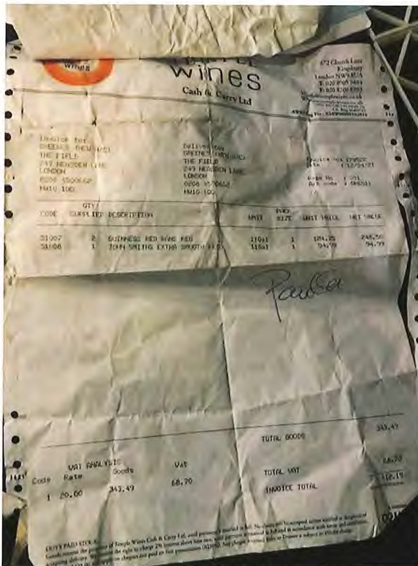
A Cash & Carry receipt dated 12 th April 2021