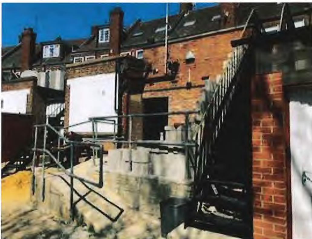
Rear of The Field Public House which is located in an alleyway. The black door is where entry was gained to the premises

Photographs taken on 23 rd April 2021 between 14.03hrs and 14.14hrs