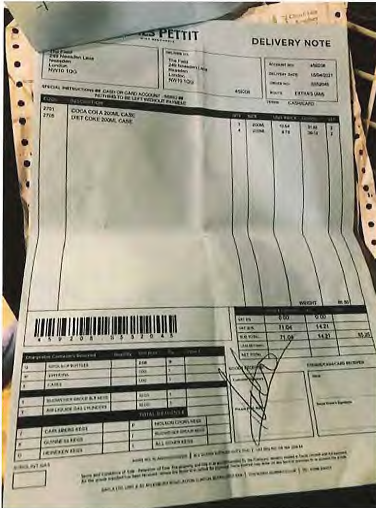
The second page of the delivery note registered to The Field PH address dated 15th April 2021